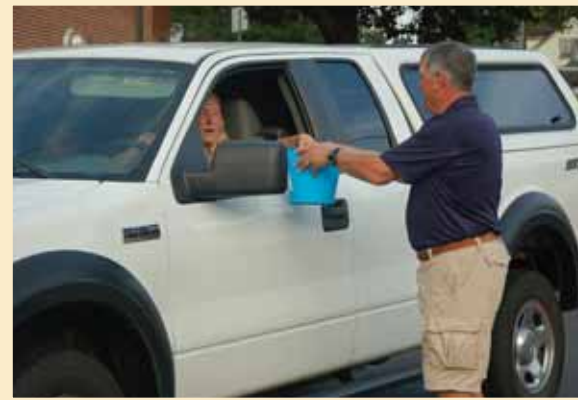
Rotary Clubs team up! Rotarians collected $1601.69 from the Veterans' Park entrance and $582.25 from the high school parking area. $800.85 will be donated to the Distress Veterans Fund and the remaining $1383.09 will be split between the Food Bank and Yokefellows.