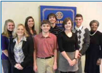
Interact Officers and Advisors