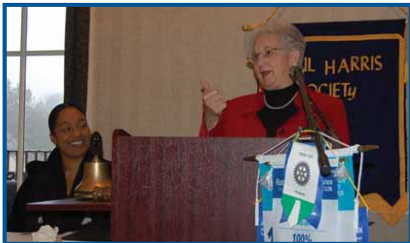
Virginia Foxx recounts the issues at hand for her office.

Virginia Foxx took time out of her busy 2 days in the area to visit with Rotarians and explain some of the new health care changes that will be up for discussion in Washington.