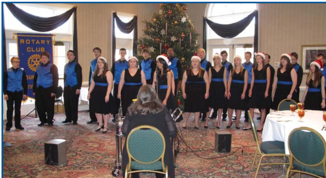
Christmas is one of our club's favorite time of the year because we get to enjoy musical performances during the month from our different schools.