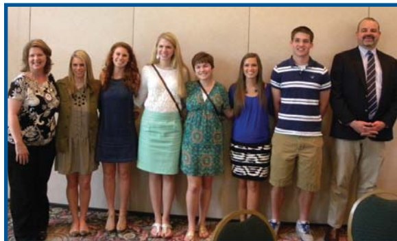
MAHS Interact Club

Their club went from a handful of members to over 50. They attracted so many students they had to start meeting in the auditorium. What a great problem to have.