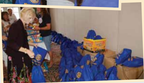
During the August 15 club meeting lunch, Rotarians ate a quick sack lunch and got busy packing bags that would be given out during the Back to School Jam Saturday, August 19.